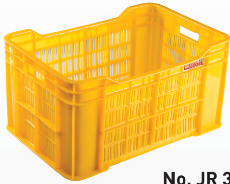
No. JR 300 D