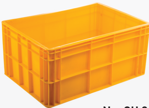
No. CH 315 D

*CH - Closed with handle slotted (ie. all sides & bottom closed with handle )