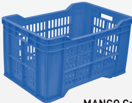
MANGO Crate 302

*JR - Jali Regular ( ie.all sides Jali including bottom.)