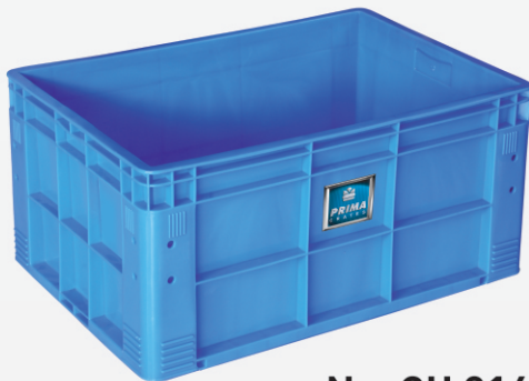
No. CH 316 DW

*CH - Closed with handle slotted (ie. all sides & bottom closed with handle )