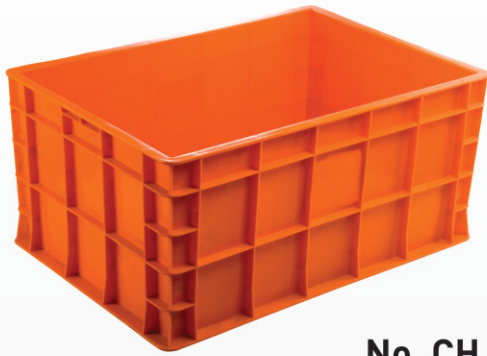
No. CH 315