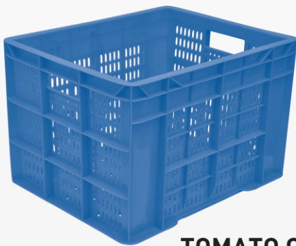
TOMATO Crate 301

*JR - Jali Regular ( ie.all sides Jali including bottom.)