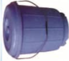
18 Ltr Bucket