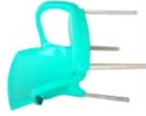
Prima Lux 1