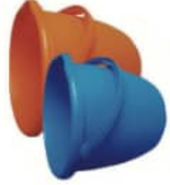
Bucket 16 Ltr