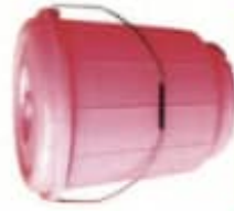
14 Ltr Bucket