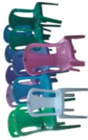
Chair Amless 4003