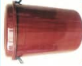
50 Ltr DRUM