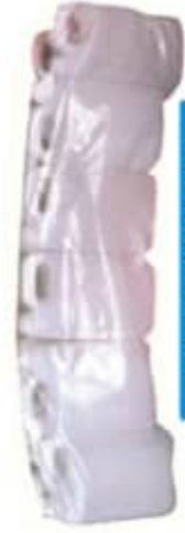
SET JERYCAN 5 Ltr