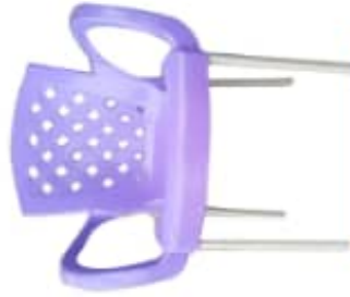
PRIMA LUX - 2