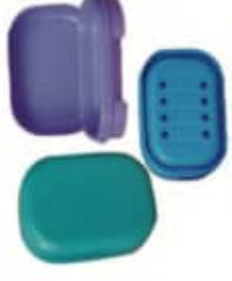
Baby Soap Box