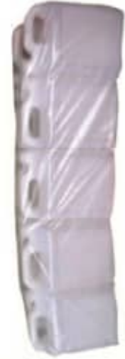
SET JERYCAN 10Ltr