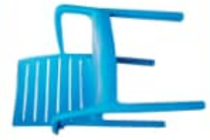
Chair Super 2