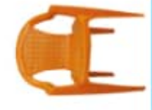
Baby chair 106