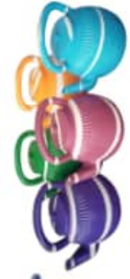
2,5 L KETTLE